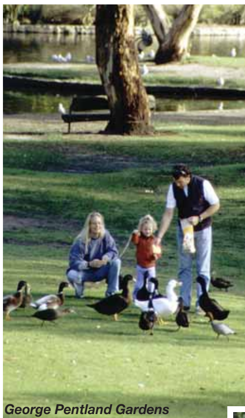
George Pentland Gardens

Langwarrin Flora and Fauna Park , about five kilometres from the centre of Frankston can be accessed via a small car park on McClelland Drive. This 214-hectare reserve, managed by Parks Victoria, is an island of relatively undisturbed natural bushland and an important habitat for native fauna, particularly small mammals.