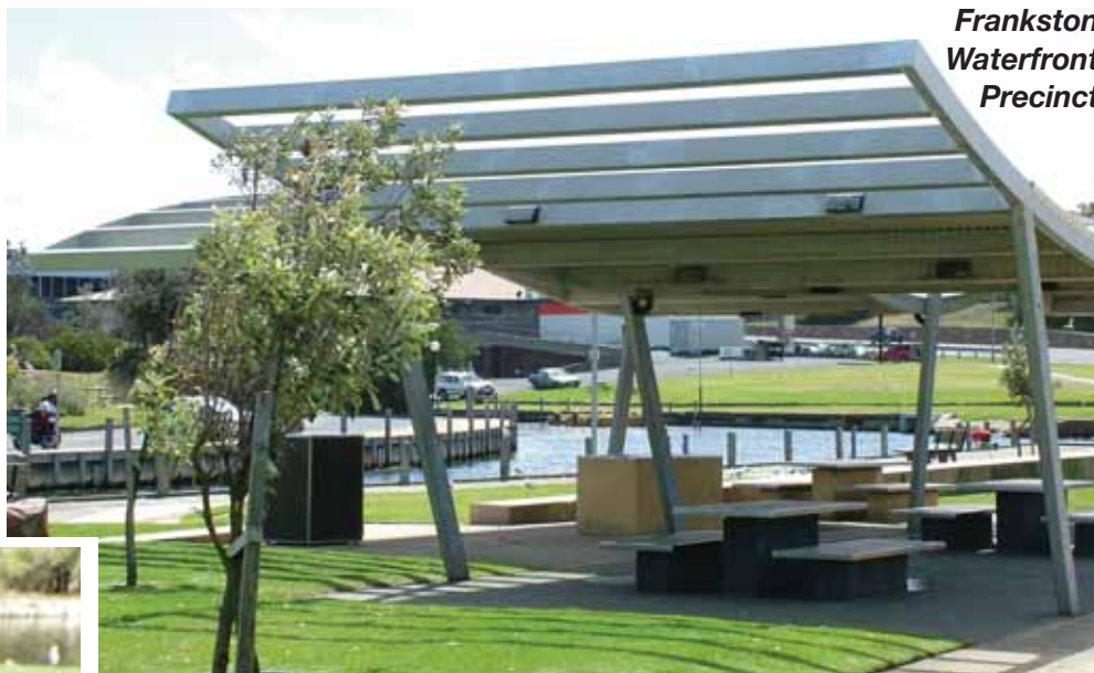
Frankston Waterfront Precinct

Recent winner of Victoria's Cleanest Beach Award , which incorporates tidiness, visitor friendliness and hospitality among other criteria, Frankston City is fast becoming an attractive tourism destination.